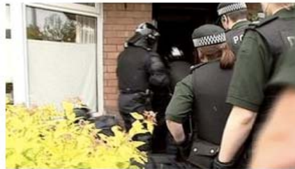
Police carry out a raid in relation to human trafficking

Last week, a man was convicted for trafficking in a Northern Ireland court for the first time.