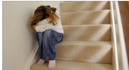
Child trafficking is a small but growing problem for Northern Ireland, the report said

The report stressed that while the problem is so far small in Northern Ireland, it is likely to grow.